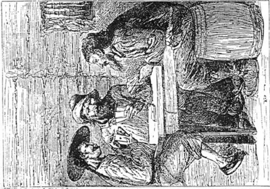
WHICH WE HAD A SMALL GAME

It was August the third; And quite soft was the skies; Which it might be inferred That Ah Sin was likewise; Yet he played it that day upon William And me in a way I despise. Which we had a small game, And Ah Sin took a hand: It was Euchre. The same He did not understand; But he smiled as he sat by the table, With the smile that was childlike and bland.