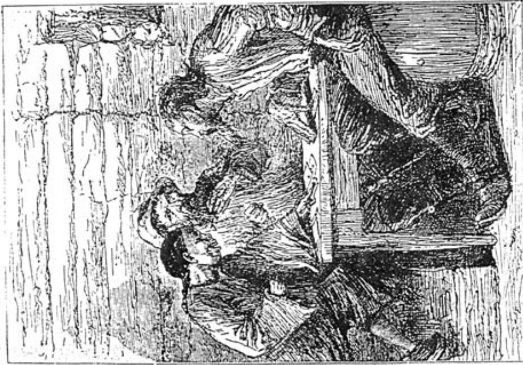
TILL AT LAST HE PUT DOWN A RIGHT BOWER