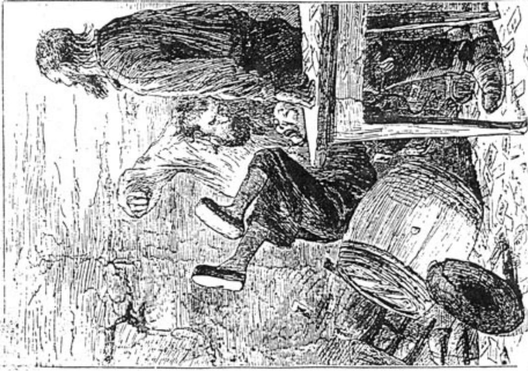
THE SCENE THAT ENSUED

Which is why I remark, And my language is plain, That for ways that are dark, And for tricks that are vain, The heathen Chinese is peculiar, — Which the same I am free to maintain.