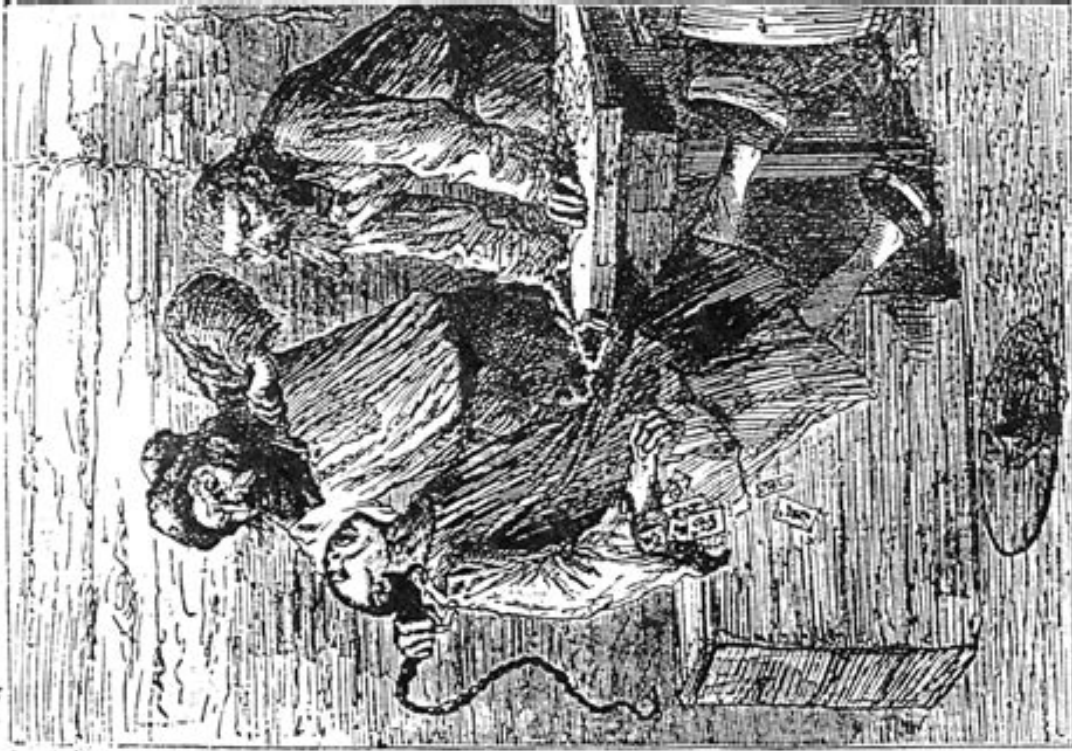
AND HE WENT FOR THAT HEATHEN CHINEE

In the scene that ensued I did not take a hand, But the floor it was strewed Like the leaves on the strand With the cards that Ah Sin had been hiding, In the game "he did not understand."